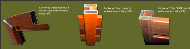
Knotwood's gate frame with corner stake and concealed fixing infill.